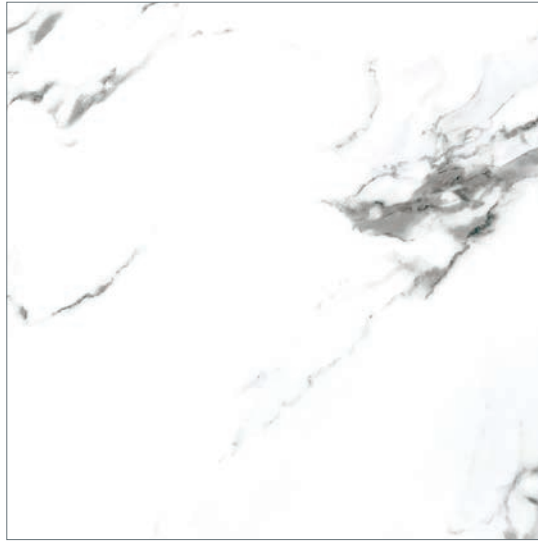
60cm x 60cm (24" x 24") Matte - OV.CX.WHT.2424.MT Polished - OV.CX.WHT.2424.PL