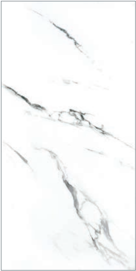
30cm x 60cm (12" x 24") Matte - OV.CX.WHT.1224.MT Polished - OV.CX.WHT.1224.PL