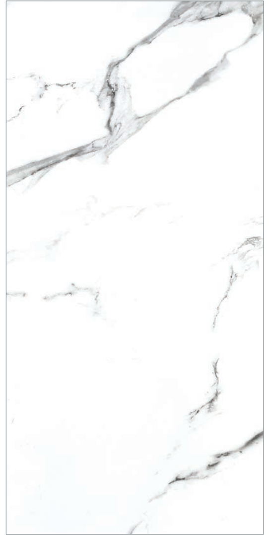
60cm x 120cm (24" x 48") Matte - OV.CX.WHT.2448.MT Polished - OV.CX.WHT.2448.PL

All items shown in this document are part of Olympia's stocking program. For special orders, please contact your Olympia Tile Sales Representative.